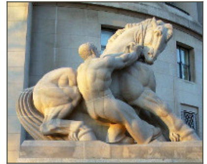
FTC statues "Man Controlling Trade"

Today the Alliance for Therapeutic Choice (Narth) has filed a national complaint at the FTC against three extremist organizations who continuously spread lies, desinformation and slander against psychotherapy for Same Sex Attractions.