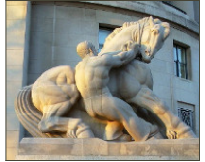
FTC statues "Man Controlling Trade"

Today the Alliance for Therapeutic Choice (Narth) has filed a national complaint at the FTC against three extremist organizations who continuously spread lies, disinformation and slander against psychotherapy for Same Sex Attractions.