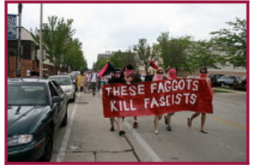
A gay-lib parade: "These faggots kill fascists!"

The small California-based law firm National Center for Lesbian Rights (NCLR) is an extremist organization, which aims to impose its world-view in a militant fashion. "Forward, fight for victories" is the army-like slogan in the fund-raising emails, "Let's make progress in our battles and never give in".