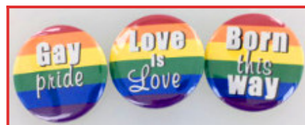
The false notion of “Born This Way”, invented in 1988 for legal reasons.

In our previous article in this series, we demonstrated that homosexuality does not exist as a separate entity. But before we expand on this, we need to understand why insights as these have become so highly contested in American society. Why do gay-lib activists insist that you were born this way and how has this unsubstantiated stance become mainstream? How can a century of psycho-analytic research have been silenced? To understand that, we need to explore the political context. Here is what happened and why. The content is shocking.