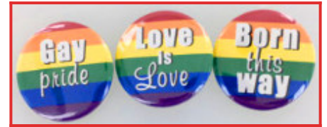
The false notion of “Born This Way”, invented in 1988 for legal reasons.

In our previous article in this series, we demonstrated that homosexuality does not exist as a separate entity. But before we expand on this, we need to understand why insights as these have become so highly contested in American society. Why do gay-lib activists insist that you were born this way and how has this unsubstantiated stance become mainstream? How can a century of psycho-analytic research have been silenced? To understand that, we need to explore the political context. Here is what happened and why. The content is shocking.