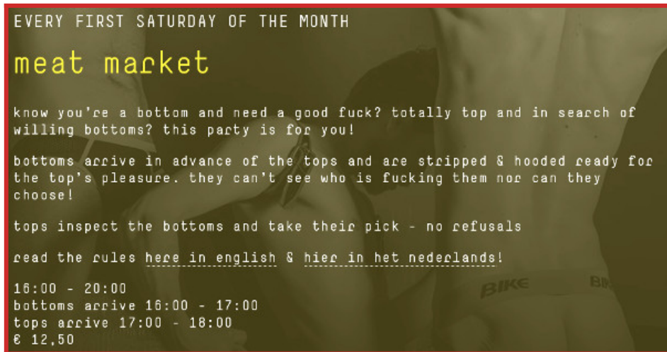
Meat Market Club in Amsterdam: (quote) "They can't see who is fucking them nor can they choose. No refusals."