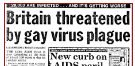
1983 First mention of a new epidemic.

In 1983 a new highly contagious disease, AIDS, spread rapidly in the circles of gay men, starting in California, USA. The epidemic was a mystery, but turned out to be closely related to homosexual behavior. Society reacted with great concern. It was then that gay activists panicked, realizing how this epidemic was exposing the downside of compulsive promiscuity.