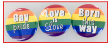
The false notion of "Born This Way", invented in 1988 for legal reasons.

In our previous article in this series, we demonstrated that homosexuality does not exist as a separate entity. But before we expand on this, we need to understand why insights as these have become so highly contested in American society. Why do gay-lib activists insist that you were born this way and how has this unsubstantiated stance become mainstream? How can a century of psycho-analytic research have been silenced? To understand that, we need to explore the political context. Here is what happened and why. The content is shocking.