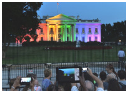
White House in the Obama era

In many states, the governmental authorities are all too glad to oblige by allowing rainbow colors to be projected on government buildings and the separatist flag to be hoisted at foreign embassies, pushing the “ Orientation Theory ” message under each and every nose. Mainstream television stations and newspapers broadcast the ideology into all households, making sure that no-one misses the message, to the glee of the extremists.