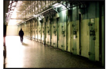
Prison in Malta

Within this imaginary “ community ”, dissidents and non-believers of labels find themselves drowned out. Radicals came to power at the end of the last century and a small in-crowd of gay activists appointed themselves as spokesmen. All others “ gays ” have been marginalized. And those who dare oppose Orientation Theory in psychotherapy find themselves being persecuted in various American states. When this radical ideology conquers the White House yet once more, as the extremists successfully achieved with Obama, the persecutions will take on an even grimmer outlook.