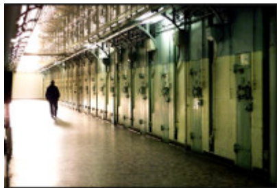
Prison in Malta

Within this imaginary “ community ”, dissidents and non-believers of labels find themselves drowned out. Radicals came to power at the end of the last century and a small in-crowd of gay activists appointed themselves as spokesmen. All others “ gays ” have been marginalized. And those who dare oppose Orientation Theory in psychotherapy find themselves being persecuted in various American states. When this radical ideology conquers the White House yet once more, as the extremists successfully achieved with Obama, the persecutions will take on an even grimmer outlook.