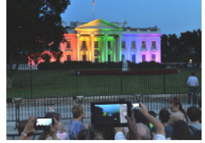
White House in the Obama era

In many states, the governmental authorities are all too glad to oblige by allowing rainbow colors to be projected on government buildings and the separatist flag to be hoisted at foreign embassies, pushing the “ Orientation Theory ” message under each and every nose. Mainstream television stations and newspapers broadcast the ideology into all households, making sure that no-one misses the message, to the glee of the extremists.