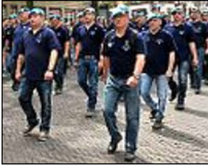
Dutch army veterans

In the Netherlands, a new drug, MDMA (“Molly”), is being tested by the Arq Psychotrauma Expert Group on PTSD patients (Dutch army veterans) to help them overcome their hesitance and resistance towards discussing the subject matter ( phase 3 trial ). It will become part of standard therapy within a year or two, because avoiding speaking about the past events is the major psychiatric problem in this patient group.