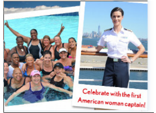
NCLR boat trip on the MS Olivia

In 2015 the NCLR organized a boat trip on the MS Olivia for 2.000 lesbians. The captain was male, he was replaced. Imagine anyone else replacing a captain because he is gay!!