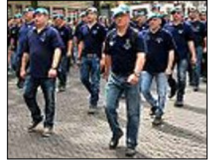
Dutch army veterans

In the Netherlands, a new drug, MDMA (“Molly”), is being tested by the Arq Psychotrauma Expert Group on PTSD patients (Dutch army veterans) to help them overcome their hesitance and resistance towards discussing the subject matter ( phase 3 trial ). It will become part of standard therapy within a year or two, because avoiding speaking about the past events is the major psychiatric problem in this patient group.