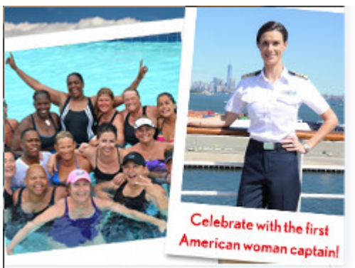
NCLR boat trip on the MS Olivia

It is the subject itself, heterosexuality , that they want silenced for youths, and ultimately for adults, regardless of the own wishes of the client in question and the existence of bisexuality and sexual fluidity. This phenomenon is called homosexism , meaning that the gay label is the only way to go. And they do so by emotional manipulation of the public opinion.