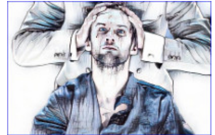
Let APA do the thinking

The self-declared mutants will rule; don’t bother thinking for yourself, let APA do the thinking. The dangers of thinking of the opposite sex are too great for you to handle.