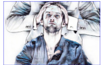
Let APA do the thinking

The self-declared mutants will rule; don't bother thinking for yourself, let APA do the thinking. The dangers of thinking of the opposite sex are too great for you to handle.