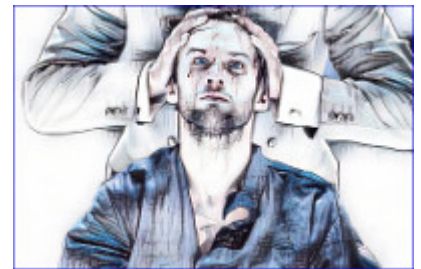
Let APA do the thinking

The self-declared mutants will rule; don't bother thinking for yourself, let APA do the thinking. The dangers of thinking of the opposite sex are too great for you to handle.