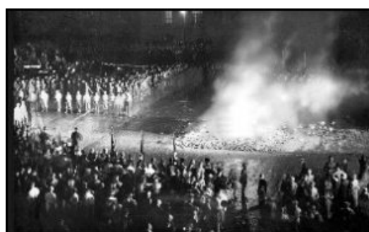
Nazi book burning, 1933

In the text of the bill AB2943 in California, a picture of “ contemporary science ” was presented to legislators. An array of professional organizations was depicted, all of whom seem to condemn therapy. As a result, the activists insist that books have to be banned, just like in 1933 pre-war Germany. The activists want to be the one who decides for you what is good for you. To that end, they search for state coercion, meaning ultimately state-approved violence, in order to run other people’s lives, to shape their thoughts and to direct their emotions. In a learned tone of voice, the supporters of the bill announce sound and trustworthy research. But when we read carefully, we observe that the array in itself is false, deceptive and fraudulent. Activists present fake news . Let us choose one of these professional organizations, SAMHSA, and examine what it has to say. The other organizations are merely more of the same.