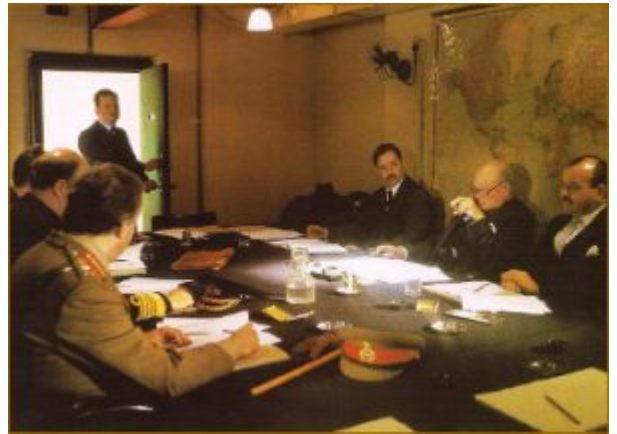
War Council, Sir Winston Churchill, 1945

“This document is based on the consensus statements developed by an expert panel convened by the American Psychological Association, Division 44, July 2015.”