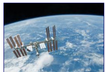
A view from the International Space Station

In spite of brutal activist pressure, 42% of psychiatrists nationwide in 1973 voted against removing homosexuality from the list of noteworthy topics for counseling and research.