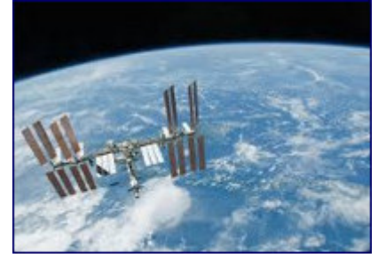
A view from the International Space Station

This doubt stands to this day. And the books, conferences, articles and facilities that we see nationwide, are a living tribute to the existence of a bigger scope of view, as if looking at the world from the International Space Station.