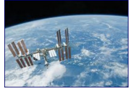
A view from the International Space Station

This doubt stands to this day. And the books, conferences, articles and facilities that we see nationwide, are a living tribute to the existence of a bigger scope of view, as if looking at the world from the International Space Station.