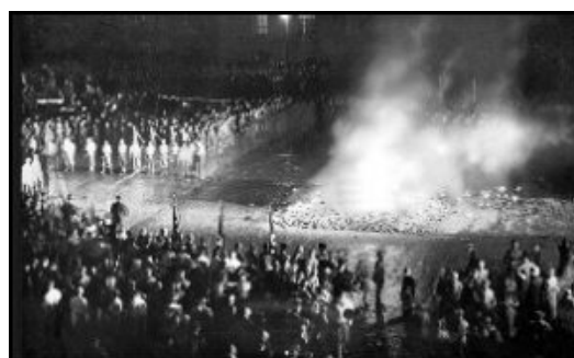
Nazi book burning, 1933

In the text of the bill AB2943 in California, a picture of “ contemporary science ” was presented to legislators. An array of professional organizations was depicted, all of whom seem to condemn therapy. As a result, the activists insist that books have to be banned, just like in 1933 pre-war Germany. The activists want to be the one who decides for you what is good for you. To that end, they search for state coercion, meaning ultimately state-approved violence, in order to run other people’s lives, to shape their thoughts and to direct their emotions. In a learned tone of voice, the supporters of the bill announce sound and trustworthy research. But when we read carefully, we observe that the array in itself is false, deceptive and fraudulent. Activists present fake news . Let us choose one of these professional organizations, SAMHSA, and examine what it has to say. The other organizations are merely more of the same.