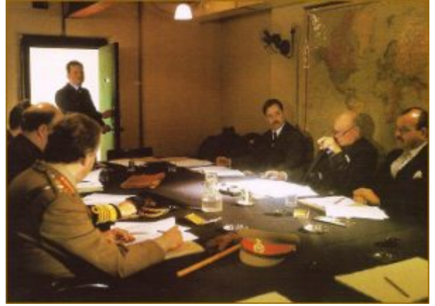
War Council, Sir Winston Churchill, 1945