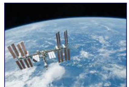
A view from the International Space Station

In spite of brutal activist pressure, 42% of psychiatrists nationwide in 1973 voted against removing homosexuality from the list of noteworthy topics for counseling and research.