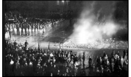
Nazi book burning, 1933

In the text of the bill AB2943 in California, a picture of “ contemporary science ” was presented to legislators. An array of professional organizations was depicted, all of whom seem to condemn therapy. As a result, the activists insist that books have to be banned, just like in 1933 pre-war Germany. The activists want to be the one who decides for you what is good for you. To that end, they search for state coercion, meaning ultimately state-approved violence, in order to run other people’s lives, to shape their thoughts and to direct their emotions. In a learned tone of voice, the supporters of the bill announce sound and trustworthy research. But when we read carefully, we observe that the array in itself is false, deceptive and fraudulent. Activists present fake news . Let us choose one of these professional organizations, SAMHSA, and examine what it has to say. The other organizations are merely more of the same.