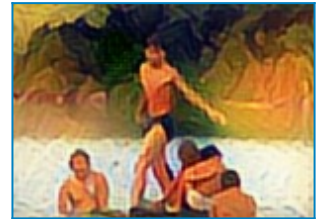
All-boy gang swimming

In those important, developmental years, you got angry, became a difficult child and did all that a 2 or 3-year old can do to get that necessary attention. And the way your infantile protest was dealt with, and usually suppressed, caused you to shut down, and to feel resentment. You decided (as far as a 3-year old can “decide”) that the males could all go to hell. You wisely started defending yourself against this impossible predicament by detaching from that man, from that desire, from males altogether and all that they stand for.