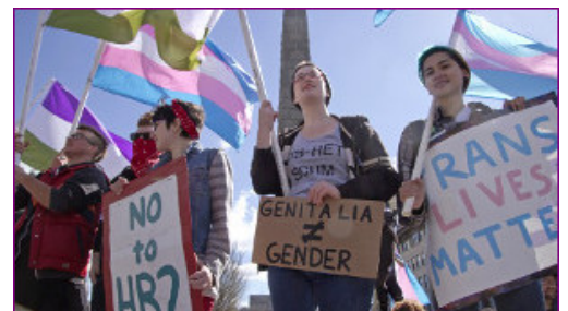
Sign saying “Genitalia Does Not Equal Gender”

The radical activist goal is to squash the healthy natural development of the body at the