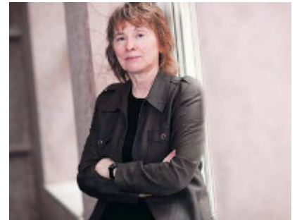
Camilla Paglia, PhD

On the website Voice Of The Voiceless , we read her expressing this opinion: