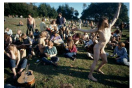
Californian teach-in 1969

At the root of this cultural change is the birth of hippie gay-lib teach-ins in the Californian sunshine around 1969 and the radicalization that occurred within certain factions after 1996.