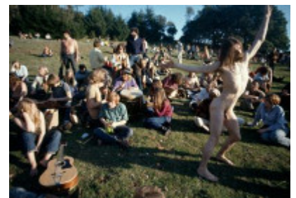
Californian teach-in 1969

At the root of this cultural change is the birth of hippie gay-lib teach-ins in the Californian sunshine around 1969 and the radicalization that occurred within certain factions after 1996.