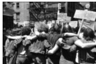
1973 disruption of the psychiatric convention in Washington

Freud who said in the year 1905 that all humans are gifted with an all-encompassing sexuality was defamed; McKinsey who said in 1947 that separate labels like homosexual and heterosexual do in no way describe the multitude of fluid feelings and human experiences, was ostracized.