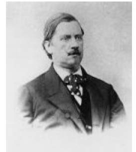
Dr. Karl Maria Benkert

To understand the fanaticism of a fringe of loud-mouthed radicalized activists, we need to delve very shortly into the history of the term “gay”.