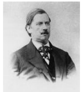
Dr. Karl Maria Benkert

To understand the fanaticism of a fringe of loud-mouthed radicalized activists, we need to delve very shortly into the history of the term “gay”.