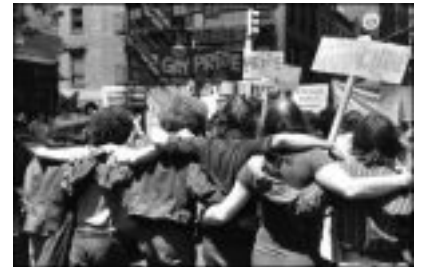
1973 disruption of the psychiatric convention in Washington

Freud who said in the year 1905 that all humans are gifted with an all-encompassing sexuality was defamed; McKinsey who said in 1947 that separate labels like homosexual and heterosexual do in no way describe the multitude of fluid feelings and human experiences, was ostracized.