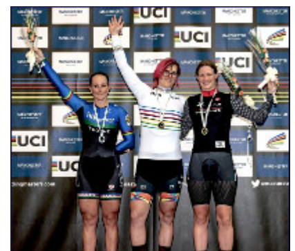
Biological male wins female cycle contests

Biden does not have the expertise to contradict the transgender coup and the press releases that his staff produces, are full of activist rhetoric. In many states, it is no longer even necessary to have had hormones or surgical treatment, it is sufficient to say that one is “non-binary” to be enrolled as transgender and to compete in sports as a member of the opposite sex.