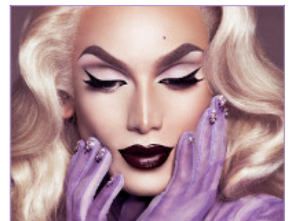
A male victim of transdelusionism

In doing so, the emancipation movement has dug its own grave because a false sense of solidarity has been forged, making criticism impossible. And that is exactly what the transdelusion activists aimed for. All for one, and one for all: a risky and un-called-for gamble by the gay activists.