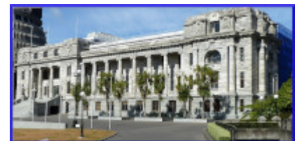
Parliament House, New Zealand

He seeks to secure five years imprisonment for professionals and lay persons who would seek to “ change or suppress the sexual orientation, gender identity, or gender expression ”. The bill is meant to apply to persons of all ages, irrespective of their own wish. The Bill is now open to criticism from the general public before moving on in the bureaucratic process. As of October 2021, more than 100.000 New Zealanders have submitted written protests to this outrageous proposal.