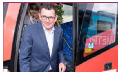
Victoria's premier Daniel Andrews

We observe no introspection. No activist is taking a good long look at him/herself. A sense of perfection abounds and self-backpatting is the way to go. The gulags of the Outback are the destination for the unbelievers.