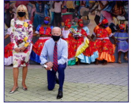
Joe Biden deliberately kneeling in defiance

And now, president Joe Biden shows the next generation how to defy all that America ever stood for by kneeling during ceremonies where you were supposed to be united in standing proud. Is he hailing a Divided States of America, the DSA?