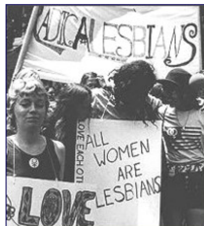
Sign reading: "All women are lesbians"

Well, in my family history, my father was more of a hen-pecked husband doing all he could to please his insatiably dissatisfied wife than a tyrant oppressing a subordinated sex slave. Poor guy, how I pitied him. So, the phrase is purely a matter of opinion. We see this worldview one-sidedly lying at the heart of the feminist movement.