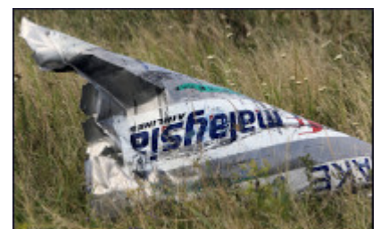
Malaysia Airlines MH17 crashdown

Trust this former top Soviet spy and counterspy to come up with something like that. Faking things was his job. It is a powerful move and our radicalized emancipation colleagues are following suit.