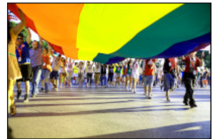
Flags, the size meant to intimidate

These parades have morphed into the biggest array of Putin Putsches in the West. All debate has been transformed along the lines of irrationality. We see 6 to 7 colors without a rational debatable message attached (they form a projection screen), flags (preferably king-size and immersing the surroundings as far as the eye can see; very intimidating), music (The Village People singing "YMCA" or Queen singing "Another one bites the dust", preferably very loud), smiling faces, a community spirit (fake or otherwise), and no-brainer one-liner slogans which cannot be contradicted, for example: "Love", "Peace", "The right to exist", and sappy close-up photos of two intertwined young girls' hands. Can't go wrong with this setup. This is as irrational as they come and the setup is foolproof.