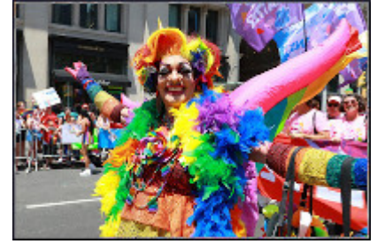
"Wearing clothes we never wear otherwise, just to annoy"

We, moderate secular activists, say: improve the world and start with yourself : take a good long look at yours truly. What am I doing as a person? What are we doing as a movement? And what is all this 'homosexuality' of ours, anyway? What on earth are we trying to prove with Gay Pride Parades wearing clothes and make-up we never wear otherwise, just to annoy? What's up?