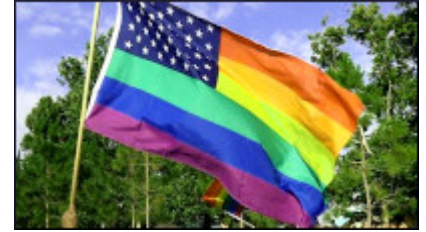
A minority led 'coup d'état'?

They are increasingly trying to replace the American flag with a rainbow incorporated into it. This can truly be seen as an irrational signal to seize or overthrow the American government, a real “ Putsch ” or “ coup d’état ”. And the non-verbal image is not up for debate. Imagine another minority pressure group, ISIS, doing that! All hell would break loose.