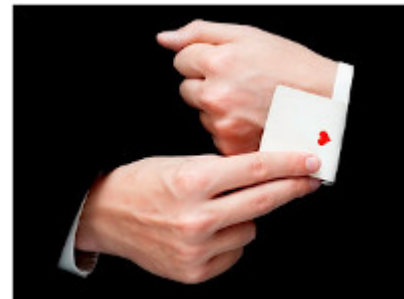
Sleight-of-hand card trick

ern leaders in NL and AU demand an investigation of these atrocities committed by the Russian military or allied separatists who no doubt used Russian weapons. Putin replies that he could not agree more. “We need total transparency on this atrocity and we commit ourselves to fully cooperating on investigations of this Ukrainian cowardly onslaught on innocent Dutch and Australian passengers” . Have you noticed the sleight-of-hand?