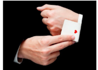
Sleight-of-hand card trick

ern leaders in NL and AU demand an investigation of these atrocities committed by the Russian military or allied separatists who no doubt used Russian weapons. Putin replies that he could not agree more. “We need total transparency on this atrocity and we commit ourselves to fully cooperating on investigations of this Ukrainian cowardly onslaught on innocent Dutch and Australian passengers” . Have you noticed the sleight-of-hand?