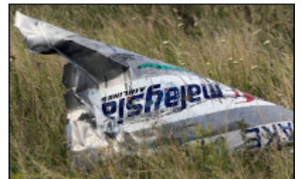
Malaysia Airlines MH17 crashdown

Trust this former top Soviet spy and counterspy to come up with something like that. Faking things was his job. It is a powerful move and our radicalized emancipation colleagues are following suit.