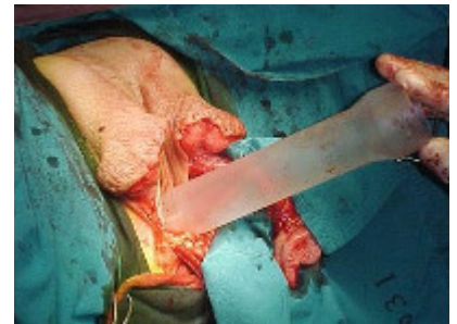
Sex transition surgery

Newspeech has come to rule the world. Our radicalized emancipation colleagues are infusing their angle into the blood-vessels of the West. Adolescents enter the operation theater male, they leave supposedly “female”. Activists have crafted English words to meet their ends. Here is a random article from the spin-doctors of trans-sexism and the way we can, by example, successfully turn it the other way around with an improved world-view.