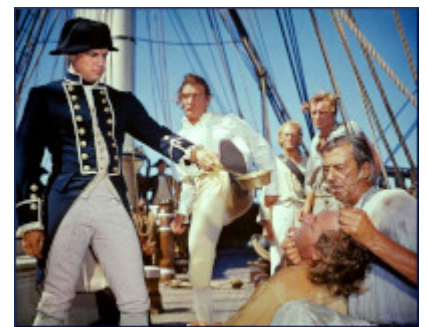
Mutiny on the Bounty

We moderates feel that it takes relentless self-criticism to ensure that we are not becoming pirates and cut-throats while we entice youngsters to "proudly" conquer the waves.