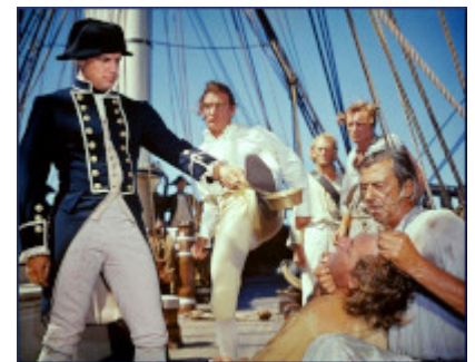
Mutiny on the Bounty

We moderates feel that it takes relentless self-criticism to ensure that we are not becoming pirates and cut-throats while we entice youngsters to "proudly" conquer the waves.