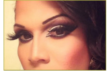
Giant-size surreal eyelashes

After age 30, many gender-confused victims who boast about their new breasts and sport their convincing hairdos and gigantic surreal eyelashes, witness a sad array of funerals in their self-inflicted "community" . They see and are horrified about how life expectancy is almost slashed in half.