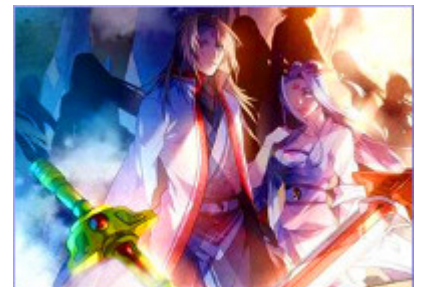
The Time Spirits

“ Era ”, these extremists say, making it sound as if critical thinking just withers away over time. There is no such thing as the “ Time Spirit ” or an imaginary god of “ Progress ” rushing